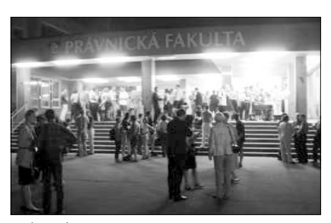
Informal discussions during the Welcome mixer